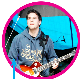
The Shins performing on stage Page 54