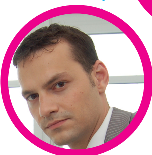
Rahm Emmanuel organizes the Democratic Revolution Page 84